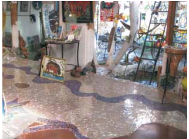
Mosaic floor in Kitengela Gallery by Nani Croze and Edith Nyambura. All recycled materials - glass made from melted-down bottles and discarded mirror and tile - were used in this mosaic.