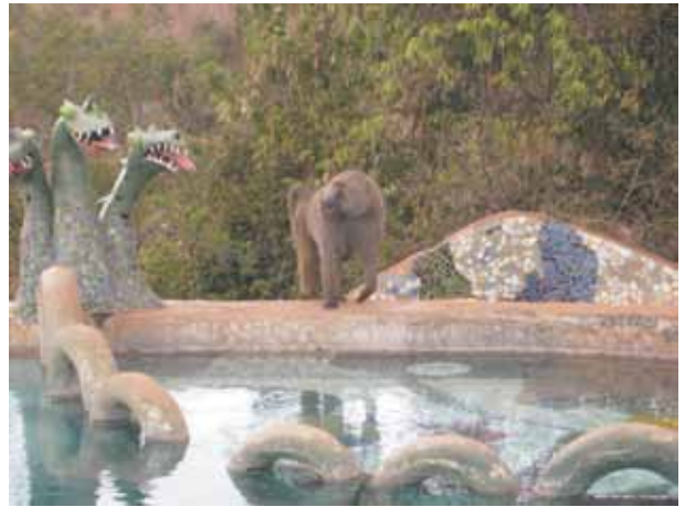
The mosaic pool at Kitengela with its fabulous sculptures. The baboons come to drink at twilight.