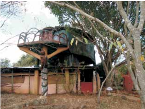
Our guesthouse. We called it our "Smurf House." It sits on the outskirts of Kitengela. Wonderful view of the plains, birds, and bush babies. And the site of the occasional leopard fight.