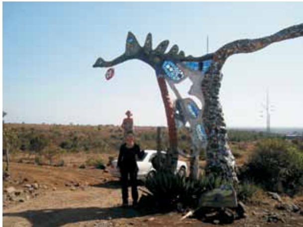
Arrival at Kitengela Glass after a long hour's drive over rocky dirt roads. Kitengela rises out of the red dust like an oasis.